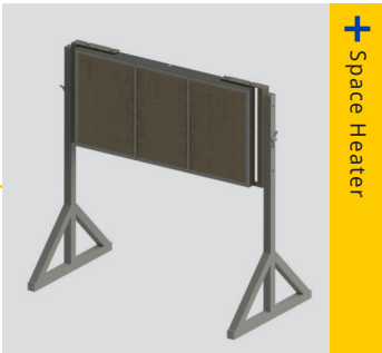
+ Space Heater