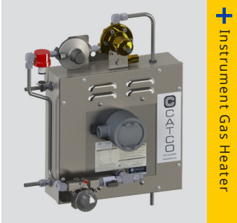
+ Instrument Gas Heater